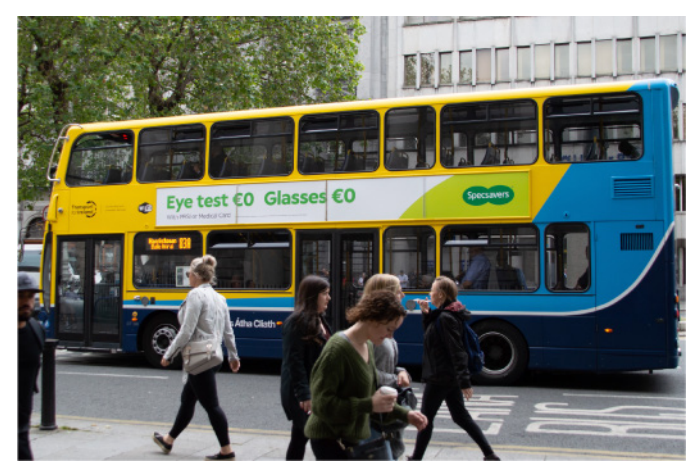
Dublin Bus Superside

Artwork should be supplied as high resolution PDF with all fonts outlined.