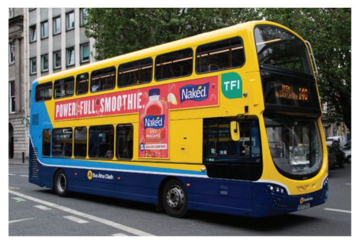
Dublin Bus T-Side

Artwork should be supplied as high resolution PDF with all fonts outlined.