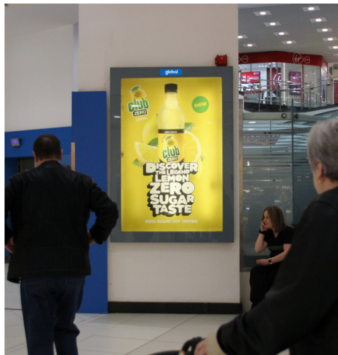
The Square Tallaght