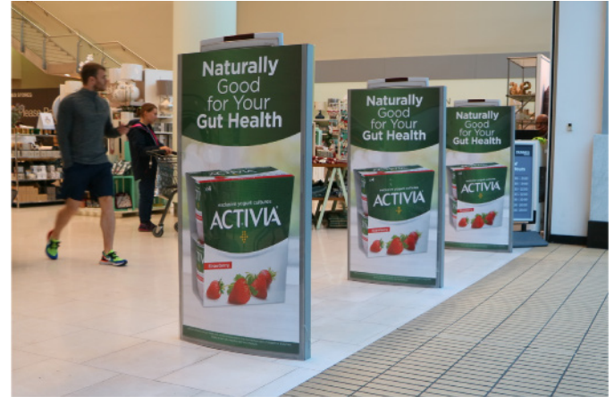
Ashleaf Shopping Centre