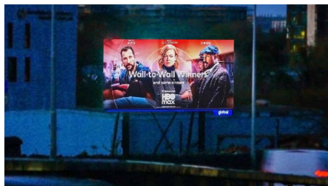
St. John's Road