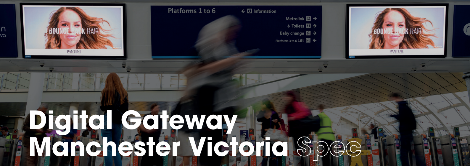
Two high definition synchronised screens above ticket gateways at Manchester Victoria station